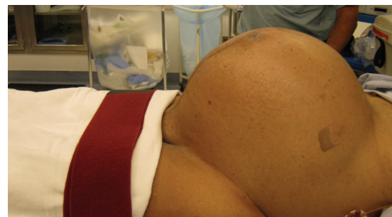
Figure 1. Patient in theater with hugely distended abdomen.