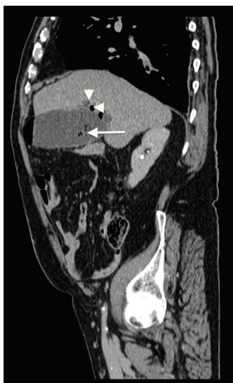
Figure 2. CT scan (sagittal axis) shows air in the gall bladder lumen (arrow) with intramural air (arrowhead) without cholelithiasis or intrahepatic abscess.

revealed necrotic changes in the gallbladder. No gallstones were detected in the gallbladder. Antibiotic treatment was given pre and post-operation. The patient's postoperative course was uneventful.