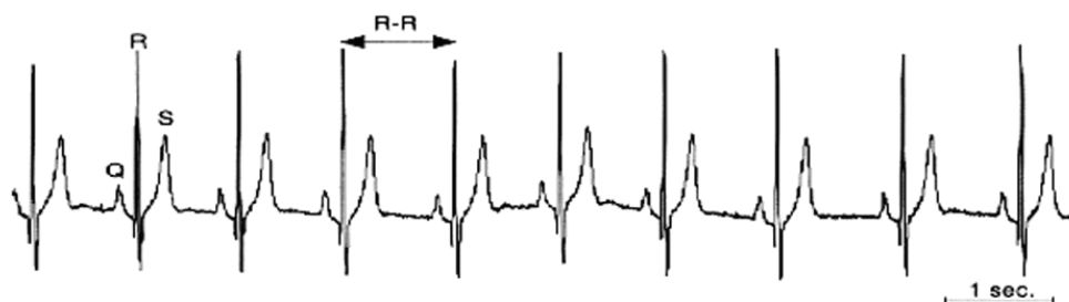
Figure 1. Extraction of sinusoidal RR intervals from ECG signals.

sion criteria are patients under cardiac treatment (Cordarone, antiarrhythmic, etc.) and the presence of heart diseases. All patients have given their consent to the study. Holter ECG is very accurate (300 Hz). The same Holter monitor brand was used of the brand (Vista Recorder, Novacor, Rueil-Malmaison). The Holter was placed at 8 pm of the night before the surgery and removed at 6 am of the next day: pre-washout Holter. Another recording was done at 6 pm after the surgery until 6 am in the next morning: Holter during washout. The frequency and the ANS activity were analyzed by means of the RR of Holter recordings. Spectral analysis of RR variability via the Fourier equation shows characteristic peaks allowing the calculation of indicators representing the autonomic nervous system activity. The most commonly used indicators are high frequencies (HFs) characterizing parasympathetic activity, low frequencies (LFs) exemplifying orthosympathetic and parasympathetic activities, and the LF/HF ratio describing the sympathovagal balance. Average comparisons were made using paired t -tests.