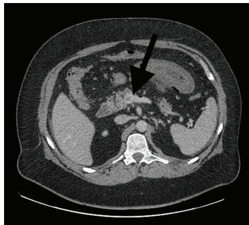
Figure 1. Abdominal CT scan with injected on admission (case 1). Arrow: a thrombosis of the superior mesenteric vein.

A 40-year-old patient underwent a laparoscopic sleeve gastrectomy for the treatment of obesity (BMI 41 kg/m 2 , decision validated upon multidisciplinary meeting). The patient was an active smoker, had a paired sleep apnea syndrome and a treated depressive disorder. The surgical procedure was simple with an operative time of 60 min. The immediate postoperative course was simple and uneventful, and the hospitalization ended on the fifth day. One month later, the