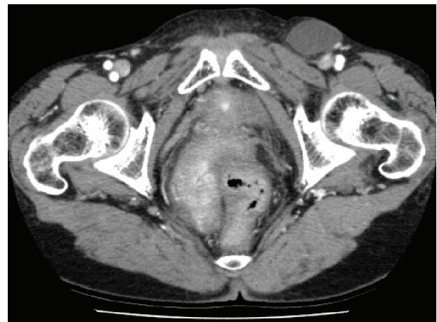
Figure 1. Computed tomography (CT) shows a cystic mass (3.6 × 5.6 cm) at left inguinal region (previous size: 3.6 × 5.1 cm).

At surgery, a unilocular cyst of 4.5 × 4.5 cm in diameter with a smooth, glistening, and translucent surface was found to be attached to the round ligament (Fig. 2). Pathology revealed a cystic-mass-like lesion, measuring 4.5 × 4.5cm in diameter. The outer surface is covered with adipose tissue and thin membranous capsule-like structure. No evidence of infiltrative tumorous lesion is noted at the outer surface. On opening the cystic content is serosanguineous fluid with no evidence of mucinous content. The inner wall of the cyst is grayish white, thin and patchy area of hematoma formation. No solid component is noted throughout. Histopathologic examination revealed simple mesothelial cyst with chronic inflammation lined by regular mesothelial cells without atypia or mitosis (Fig. 3).The postoperative course was uneventful,