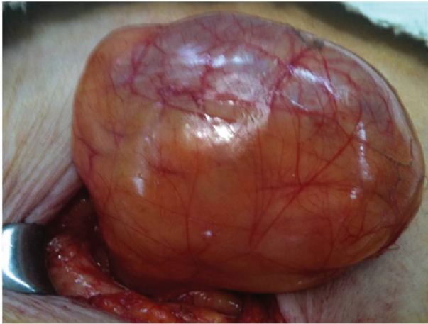
Figure 2. The extracted tumor is covered with adipose tissue, thin membranous capsule, and serous fluid collection.

and the patient was discharged from the hospital in good condition.