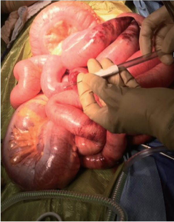
Figure 3. PI seen through small and large bowel with areas of ischemia. PI: pneumatosis intestinalis.

characterized by the inability of the body to maintain certain nutritional balances (protein, fluids, and electrolytes) that is a direct result of the surgical resection (or congenital) of the small bowel, usually when 200 cm or less of small bowel remaining. Early aggressive TPN should be performed with progressive weaning off and subsequent administration of enteral nutrition. Medications such as opiates and teduglutide, a glucagon-like peptide 2 agonist, may be administered to decrease stool output and improve intestinal growth/absorption, respectively.