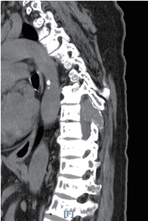
Figure 1. Characteristic CT image of the tumor. CT: computed tomography.