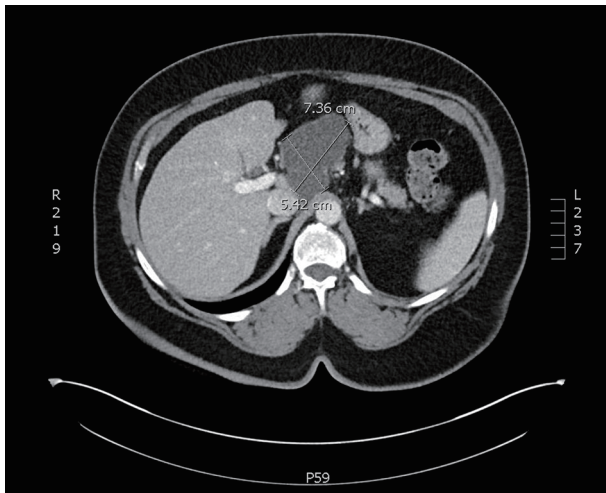
Figure 1. An axial slice from a CT scan with contrast. A cystic mass with few thin septae suggesting multi-loculation associated with the superior and anterior pancreatic body. CT: computed tomography.

ysis are consistent with pancreatic lymphangioma as they rule out other cystic lesions of the pancreas. Since the patient is currently asymptomatic, imaging studies will be used to monitor the lymphangioma.