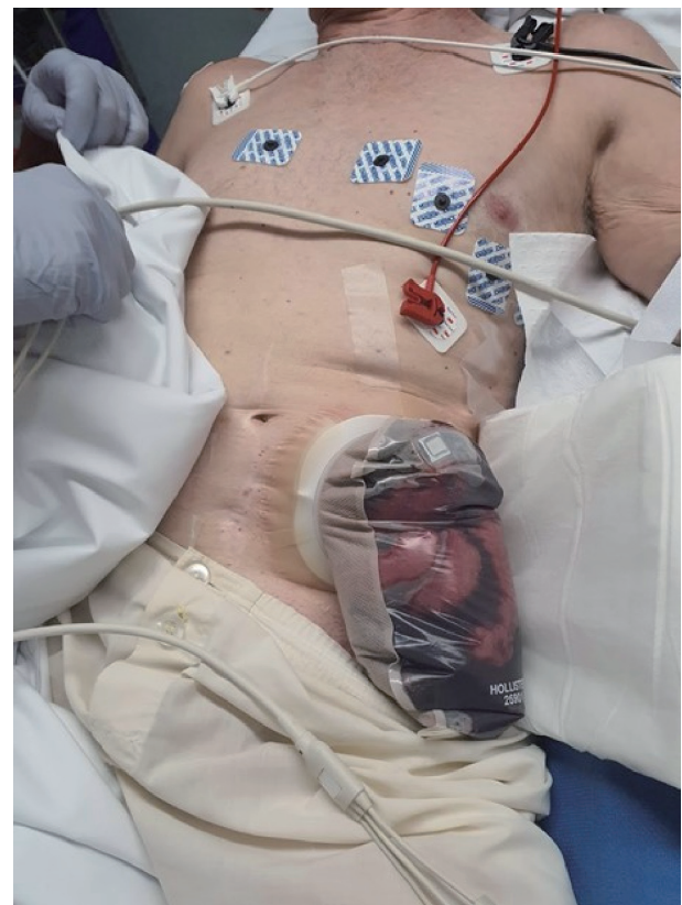
Figure 1. Eviscerated small bowel in stoma bag.

A 77-year-old male presented to the emergency department with evisceration of small bowel into his stoma bag (Fig. 1). The event was preceded by a blunt force trauma to the abdomen. He had multiple previous abdominal surgeries due to secondary effects of Crohn's disease, including an open right hemicolectomy for terminal ileal disease and subsequent loop colostomy for rectal stricture causing recurrent large bowel obstructions failing medical therapy. Due to stomal prolapse, this had been converted to an end colostomy. In addition, he had previously required a laparotomy for perforated duodenal ulcer. The patient's medical history was also significant for chronic obstructive pulmonary disease for which he was on long-term immunosuppressive therapy with systemic corticosteroids.