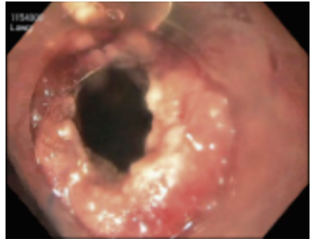
Figure 2. Esophagogastroduodenoscopy showing the 15 × 10 mm duodenal perforation.

medical course was further complicated by the development of a large ventral hernia due to significant tissue removal from the anterior abdominal wall which required reconstruction with a cadaveric skin graft.