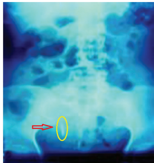
Figure 1. Pelvic X-ray film showing an intrauterine device in the lower right quadrant.

The 35-year-old woman was admitted to the department of Gynecology and Obstetrics due to abdominal pain. The patient had been using IUD for ten years and she had presented no problem regarding IUD during her regular check the year before; however, upon the detection of IUD migration via physical examination and pelvic ultrasonography (Usg), she was admitted to our department for further diagnosis and treatment. The patient stated that she had been suffering from infrequent abdominal pain for the last three months and that the pain had got more severe over the last three or four days as accompanied by nausea and vomiting. On physical